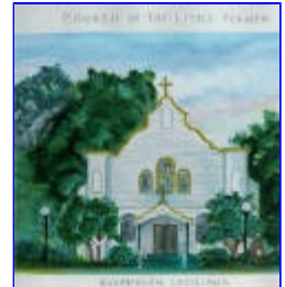
Church of Little Flower