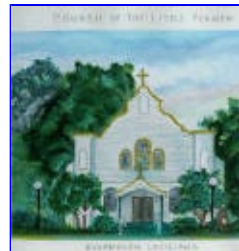
Church of Little Flower