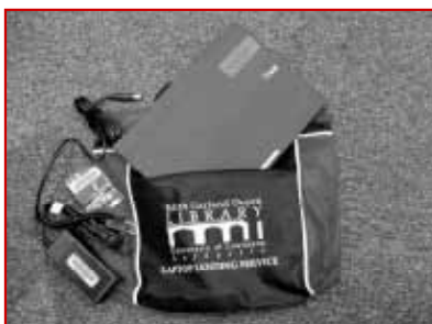
One of the laptops available from the library

Students may check out a laptop for 4-hour loan periods using their Cajun Card, just as they would check out a book. The service is available Monday through Thursday, 8:00am -4:00pm, and Friday, 8:00am-11:30am.