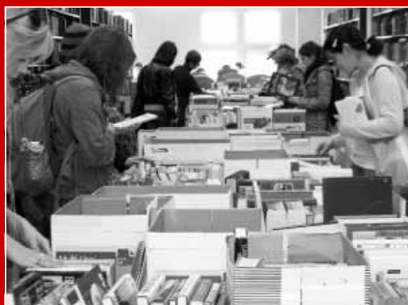
Students and visitors peruse the library's book sale

The Friends of Dupré Library held their annual book sale November 4 th through 6 th , 2010. For three days faculty, staff, students and Lafayette citizens were invited to purchase books sold in support of the Friends organization. The book sale included hardcover and paperback books along with phonograph records, adding to the Friends' contribution in maintaining materials in the library. The materials sold at the book sale are gained through the generous donations of the faculty and staff of UL-Lafayette as well as the people of Acadiana. Donated materials that are not needed for the library's collections are given to the Friends for sale.