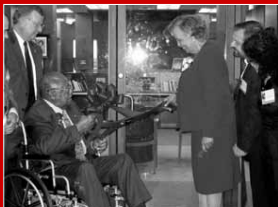
Dr. Ernest Gaines cuts the ribbon for the opening of the center

On October 31, 2010, the Ernest J. Gaines Center celebrated its formal opening in the Edith Garland Dupré Library. About 300 people attended the event honoring Gaines, who served as Writer-in-Residence at UL-Lafayette from 1981 until his retirement in 2004. Gaines spent the first fifteen years of his life on a plantation near New Roads, Louisiana, and his award-winning works depict the experience of African Americans in the rural South. The Gaines Center houses his early papers and manuscripts, published scholarship about Gaines and his work, and published translations of his writings, and is the only complete collection of Gaines scholarship in the world.